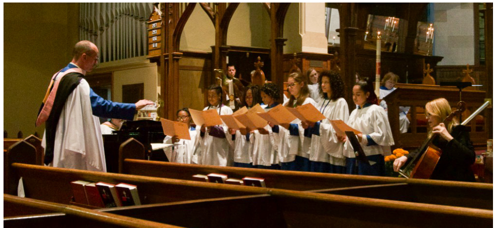
Trebles singing Ralph Vaughan Williams' Song of the Tree of Life at the All Souls' Evensong

The St. Paul's Choir School program is based on the idea that all children are able to sing, given encouragement and instruction. We offer free music education and performance opportunities for girls and boys, ages 8 through high school. We are a unique after-school program that offers professional choral training, voice and piano lessons, music theory, leadership development, and mentoring to children and teenagers. Each chorister receives individualized attention in a dynamic, creative, structured, and hands-on setting from caring teachers who are accomplished professionals in their areas of instruction. Our students come from Englewood and surrounding towns, representing a wide range of cultural communities, and from all faith traditions. Everyone is welcome!