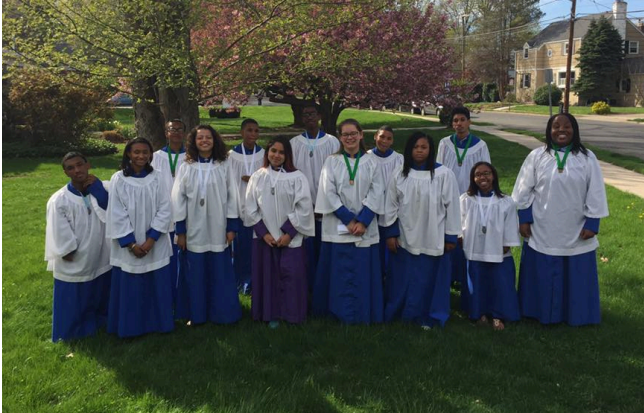
Choristers, April 2017