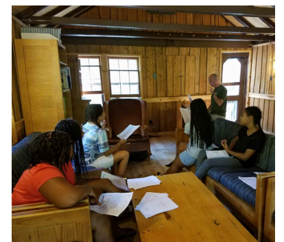
Camp Dark Waters, 2017: zipline, basketball, canoeing, treble rehearsal