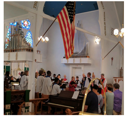
Choristers at Holiday House in Cape May, Choristers and proctors on the beach; Final Evensong in Church of the Advent